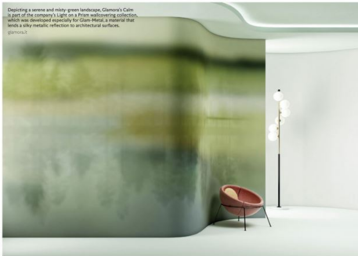
Depicting a serene and misty-green landscape, Glamora's Calm is part of the company's Light on a Prism wallcovering collection, which was developed especially for Glam-Metal, a material that lends a silky metallic reflection to architectural surfaces.